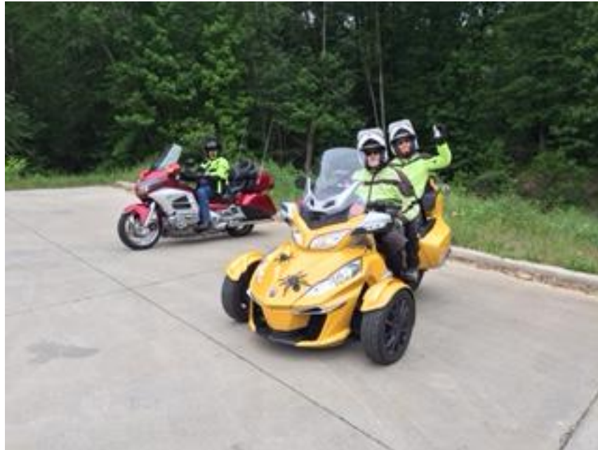
Good times in Jefferson, Texas