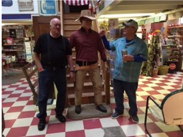
The good, the bad and the..., Who is who?

Friday was the day to check out the vendors, view the Regional Couple of the Year selection process, engage in seminars, and meet and greet people, new and old, from throughout the Region and country. Some of our members toured the historic town of Jefferson, Texas and took the back roads to explore the area around Caddo Lake. Although the weather was a little muggy we all enjoyed riding the Piney Woods of East Texas and seeing all the greenery. Later in the afternoon some members rode to Shreveport, Louisiana to see how Cajun's do their 50-30-20 drawings. Needless to say most of the winnings stayed in Louisiana.