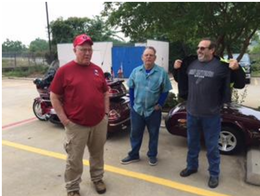
Just a few "Good Old Boys"

The Rally culminated with the presentation of two $500.00 Grand Prize checks being written to attendees other than Chapter U members.