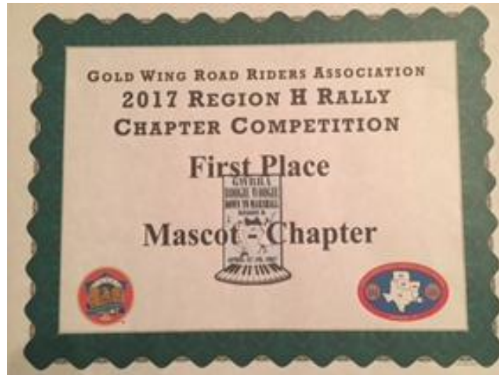
Proud penguin of Chapter U's 1 st Place award

The Honda dealership in Marshall provided a great Bar-B-Q and crawfish feast for Friday's lunch. The ribs were excellent and the crawfish with potato's and corn-on-the-cob was very tasty and spicy. Tux was impressed with the dealership, their staff and the quality of their food. Stupendous eats H&W Honda-Yamaha of Marshall, Texas!