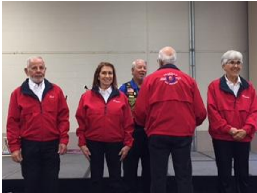
Chapter Jackets with white shirts - looking awesome!