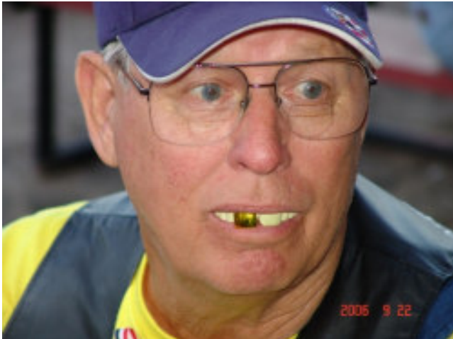
Louisiana District Director