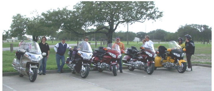
Lined up and ready to head back from the Chapter X Rally in Corpus Christi, 23 September. We all made it back before the storms!!

(Well...she might like gravel roads but I doubt she has done any on a Goldwing! I prefer to stay off gravel roads but it is handy to know how when the sign ahead says "Pavement Ends"! Brad Severe)