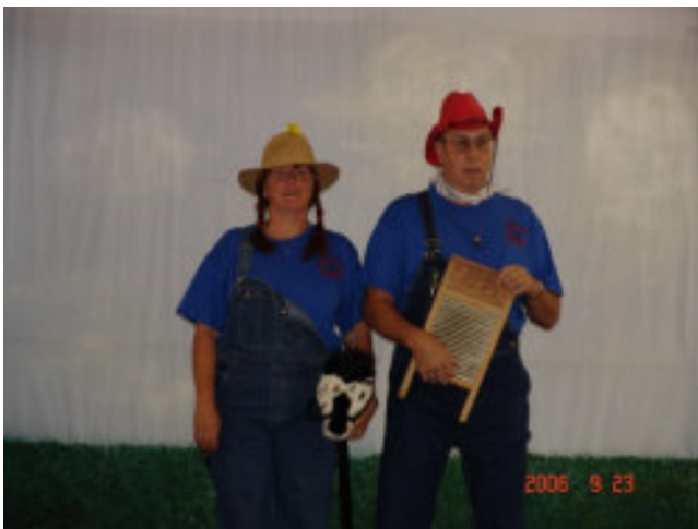
Theme Dress Competition