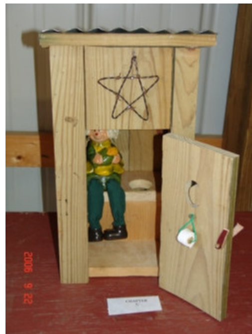
One of the "out house" entries from the Kansas District Rally

The seminars/forums are repeated (one morning presentation, one afternoon presentation) to accommodate varying arrival times as well as allowing early arrivals to attend several of the offerings. This is a great chance to see what is required of the various staff positions whether you are currently on a Chapter Staff, are considering taking a staff position, or are simply curious about what one or more staff positions involves. Remember, ALL members of GWRRA are invited – not just Chapter Staffs!